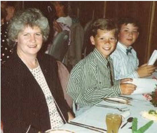
Leavers Dinner 1990