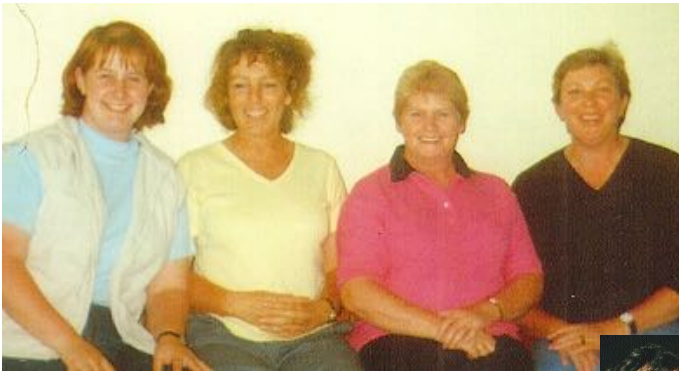
Outside old office 2000