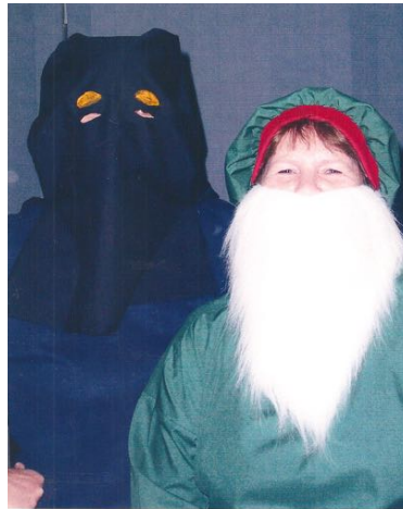
Shrek - Carols 2001