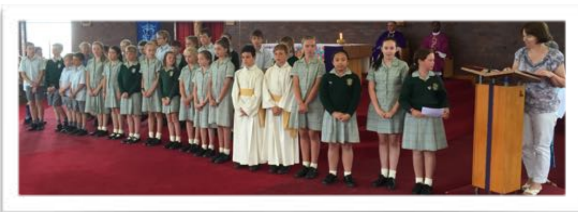
30 children made a commitment to Junior Joeys at Mass