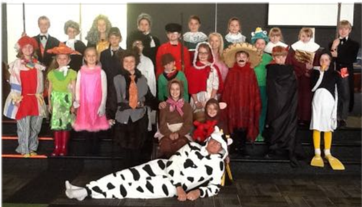
Grade 3/4 Play - The Shocking Case of Gold E. Lox Vs The Three Bears

Carols Night - limited soft drinks and water $2, aprons $20, teatowels $12, icecreams $2 and candles $2, will be sold from 5:45 - 6:45 outside the basement. A reminder to bring your own picnic, rugs, drinks, nibbles.