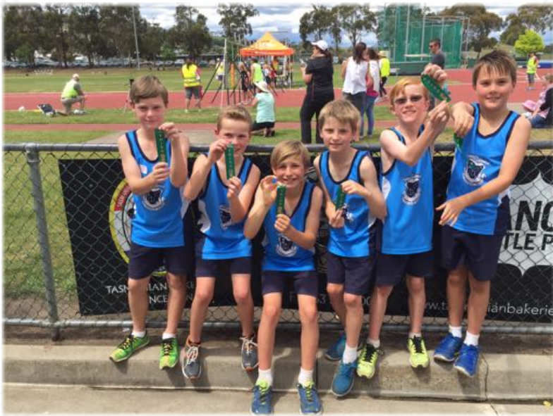
Grade 4 boys at NIJSSA Athletics Carnival